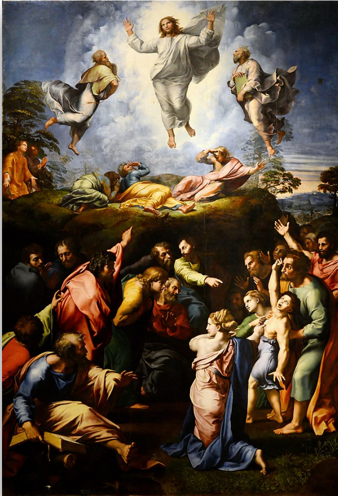
The Transfiguration by Raphael, 1516-20